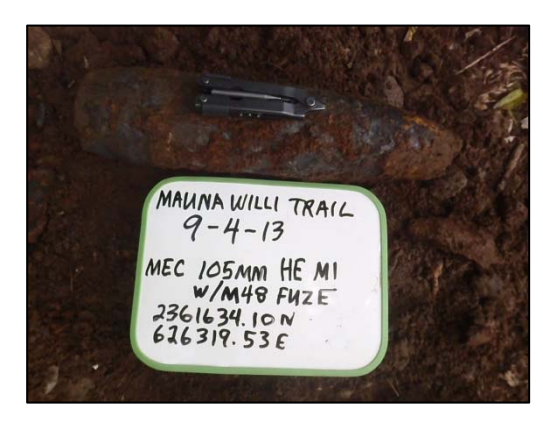
Figure 2 - 105-mm Projectile

environment. In addition, the PTC provided rugged terrain for jungle and Ranger training. An artillery impact area was also established in the rear of Maunawili Valley. In 1945, the U.S. Army released PTC and the encampment was abandoned by the end of 1945. All on-site buildings were sold for scrap in 1946 and the land reverted back to the previous owner. Currently, the ownership of the former PTC is split between the State of Hawaii and various private landowners.